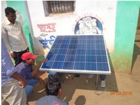
Solar Panel powering the inverter

Though the area is a gram panchayat headquarter it has no such facilities in the radius of about 20 km, also a Revenue Inspector office will open shortly. Therefore, opening of such a centre would prove to be profitable. He will also add new products and services to this centre over time.