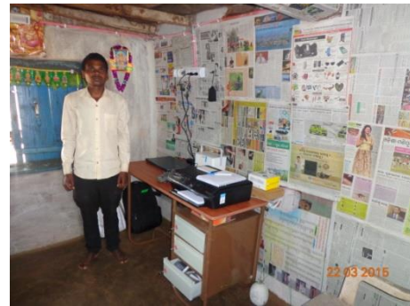
Existing entrepreneur with his systems